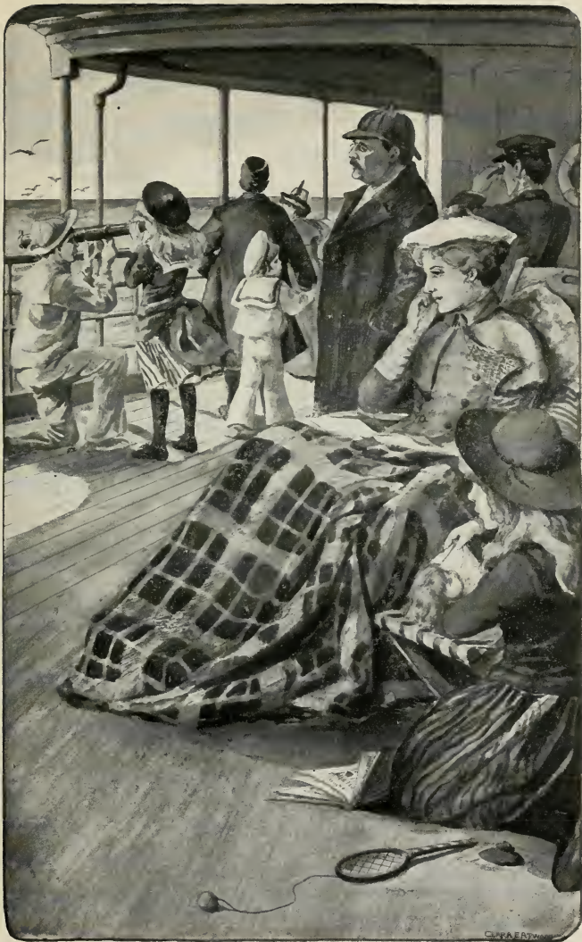
"Jenny was tired, and glad to read and dream in the comfortable seat." Page 156.